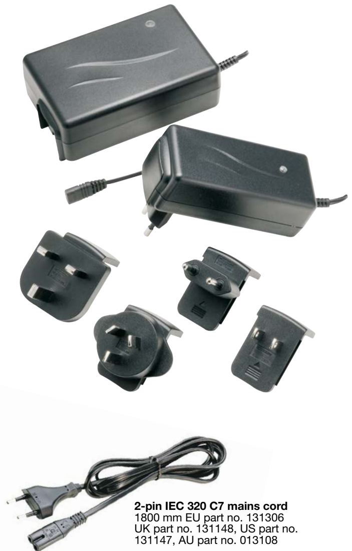
2-pin IEC 320 C7 mains cord 1800 mm EU part no. 131306 UK part no. 131148, US part no. 131147, AU part no. 013108